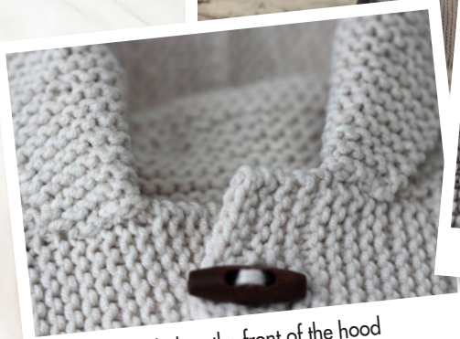
Folded on the front of the hood